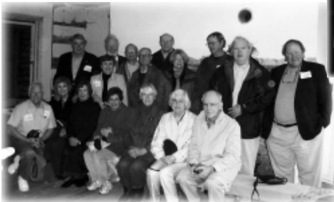
The group inside the old house waiting on the bus.