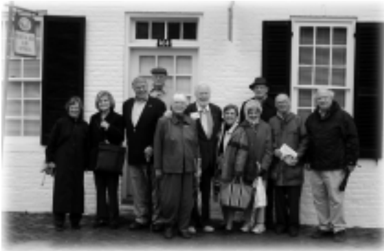
The group in front of Francis Scott Key law office.

The City of Frederick, founded in 1745, has played a major role in virtually every chapter of American history. Located at the "Crossroads of America," it was in Frederick that the "Honorable Judges" repudiated the Stamp Act, right after it's passage in 1765. It was here that many of the Hessians, captured at Saratoga, were housed by the Continental Congress. It was here that a new County was formed in 1748 to include all of what is now central and western Maryland. It was here that the roads from Alexandria and Georgetown crossed the roads from Philadelphia, Baltimore, and the new western place to be called Pittsburgh.