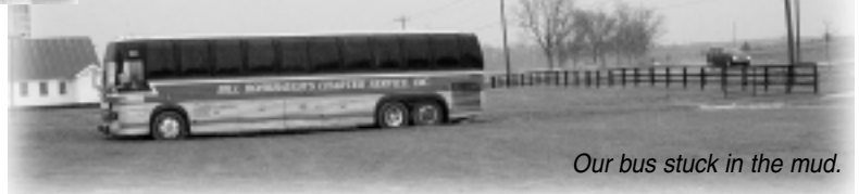
Our bus stuck in the mud.