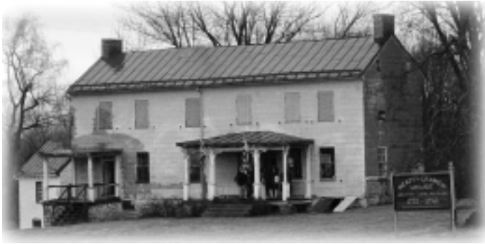
The Beatty-Cramer House