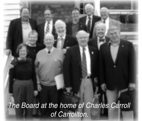
The Board at the home of Charles Carroll of Carrollton.