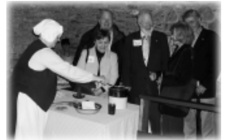
The cooking demo at the Hessian Barracks.

The City of Frederick, founded in 1745, has played a major role in virtually every chapter of American history. Located at the "Crossroads of America," it was in Frederick that the "Honorable Judges" repudiated the Stamp Act, right after it's passage in 1765. It was here that many of the Hessians, captured at Saratoga, were housed by the Continental Congress. It was here that a new County was formed in 1748 to include all of what is now central and western Maryland. It was here that the roads from Alexandria and Georgetown crossed the roads from Philadelphia, Baltimore, and the new western place to be called Pittsburgh.