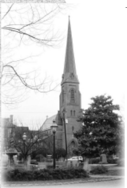
All Saints Episcopal Church