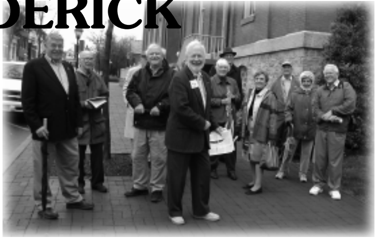
Group having fun on the street corner.