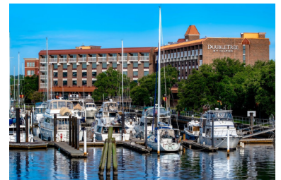
Plan to attend our fall meeting in New Bern, NC. Pages 8-9