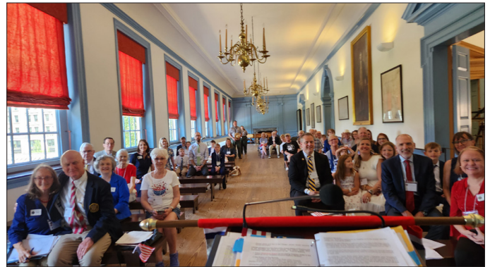
DSDI members and guests at annual meeting