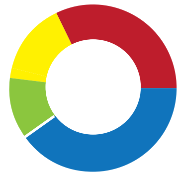
Operating Expenses for Fiscal Year Ended April 30, 2025