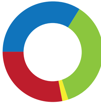
Operating Revenues for Fiscal Year Ended April 30, 2025