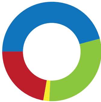
Assets as of April 30, 2025

DSDI operating expenses for the fiscal year ended April 30, 2025 were $115,579, resulting in an operating loss of $11,133. Together with net investment income and gains/losses on investments, net income was $143,127 for the year.