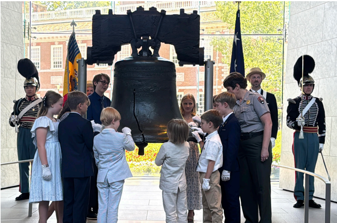
DSDI's Annual Congress took place July 3-4 in Philadelphia. For a report on the meeting and our wonderful Bell Tappers, please turn to pages 5 & 7.